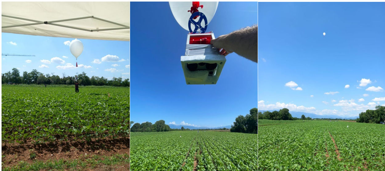
Figure 2: In the first two photos, on the left, the release phase, on the right, the tethered balloon at an altitude of 50 metres.

Of course, this is only one of the possible configurations in which ATEMO will be involved in measurement campaigns. In the coming months, in fact, other collaborations will be launched, e.g. with the Chilean PUCV (Pontificia Universidad Católica de Valparaíso) University for the determination of light pollution.