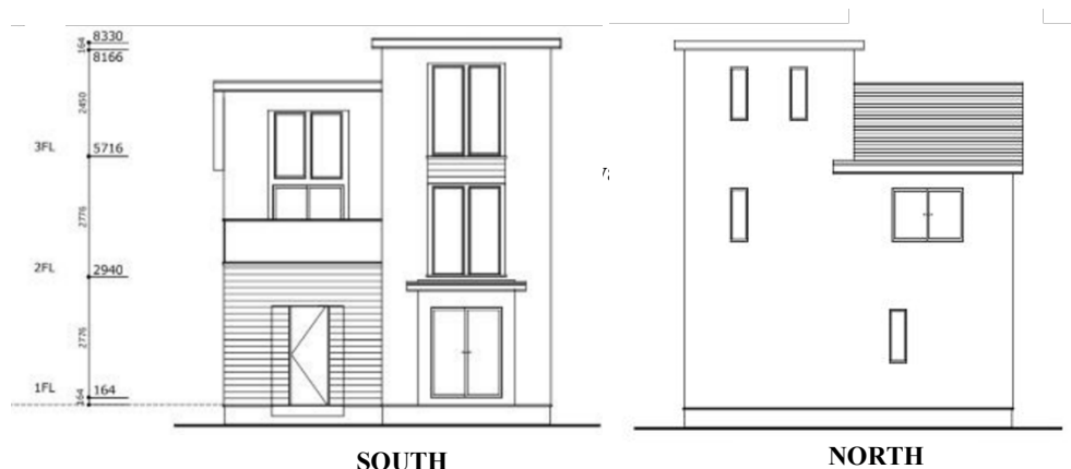
Fig.2 Elevation of the building

In this shaking table test, several types of earthquake waves were used for excitation. First, Kumamoto wave was used for 120 times and after that, other waves were used once. Table 1 shows the list of earthquake waves.